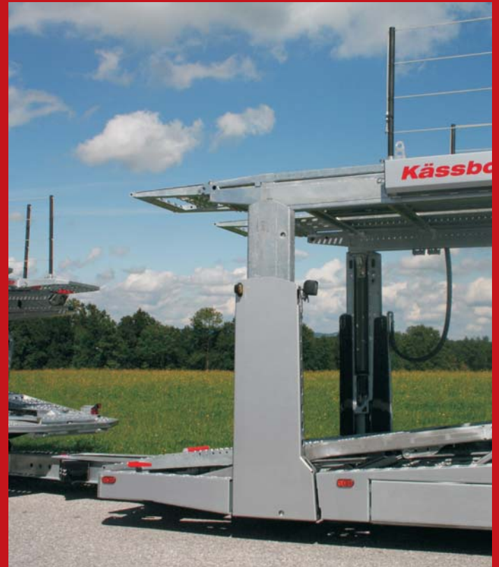
Intago tt The front lifting device is so optimized that on the upper level maximum load width available is.