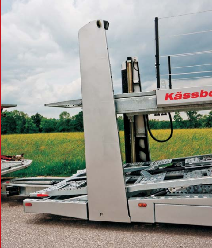
Intago ts Pillar group in front with hoist gear for optimum lifting capacity.