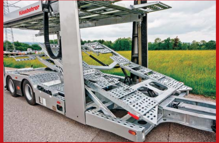
Hydraulically tiltable overdrive platform allows a simple and secure stacking.