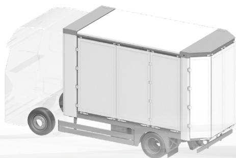
ecomode performance S2-180