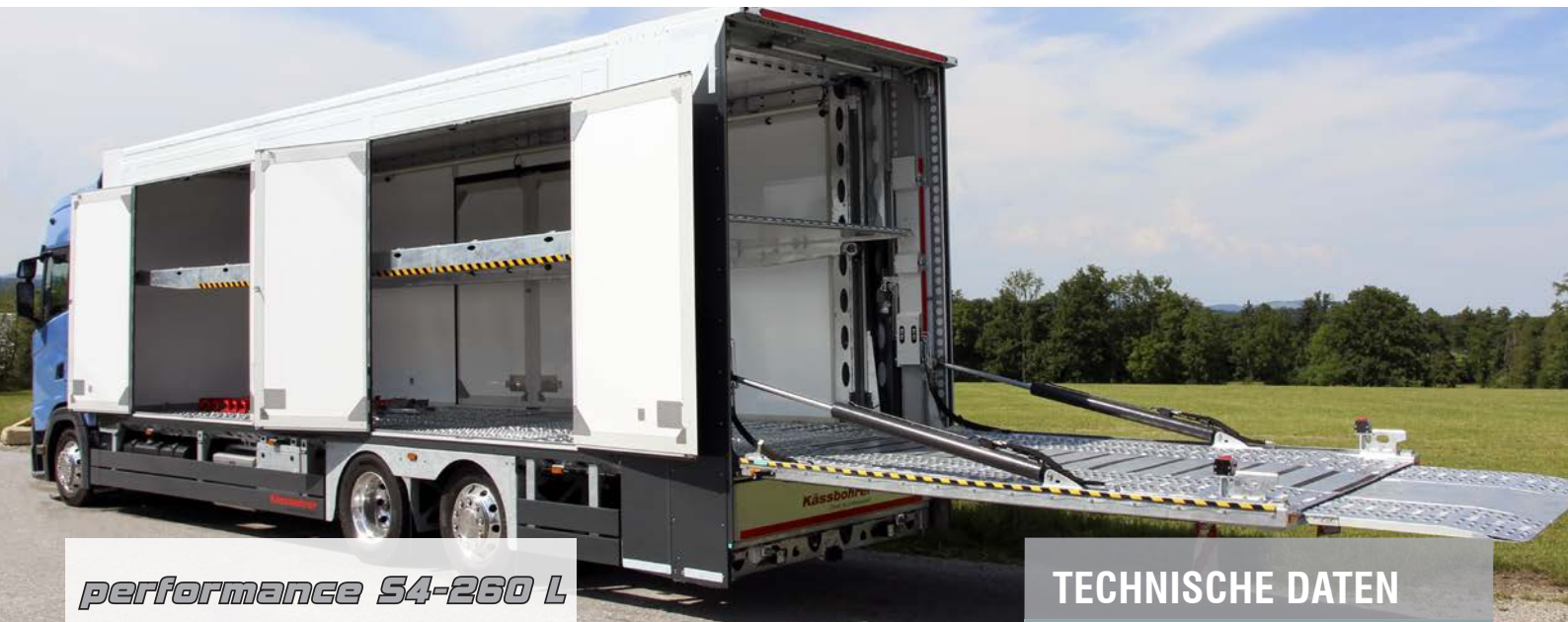
performance S4-260 L