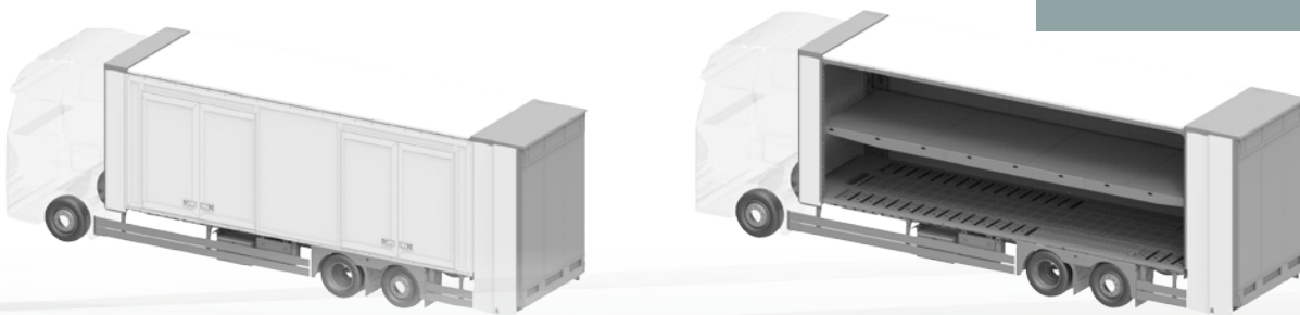
ecomode performance S4-260 L