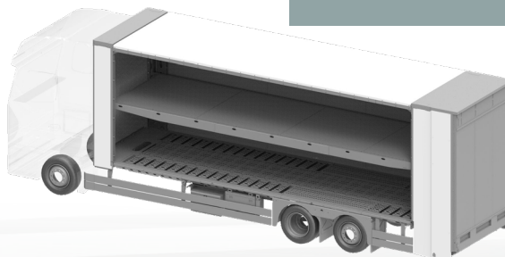
ecomode performance S4-260 L