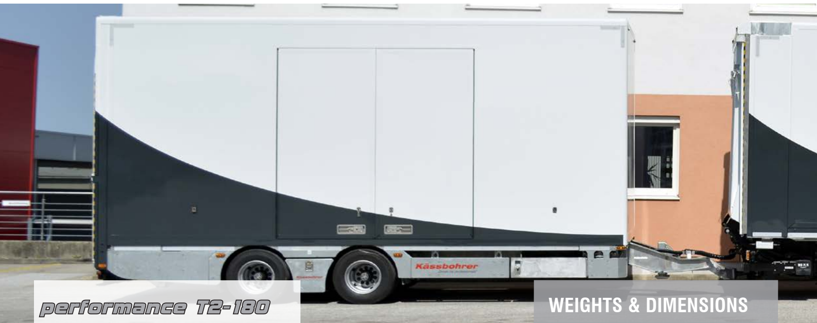
ecomode performance T2-180