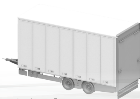
ecomode performance T2-180