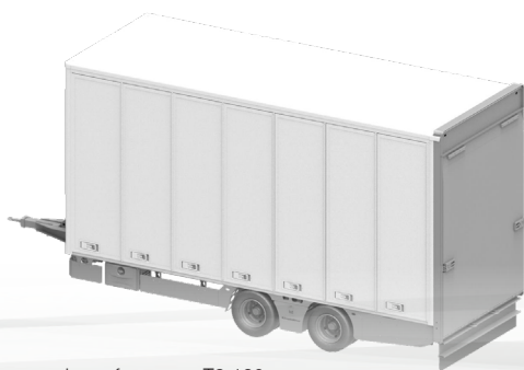
ecomode performance T2-180