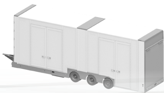
ecomode performance S2-180