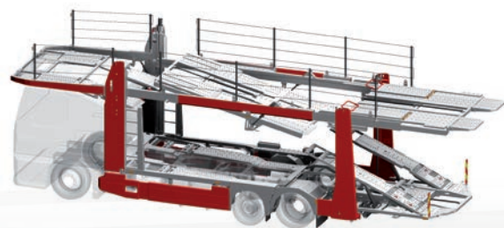
variotrans® pro A5